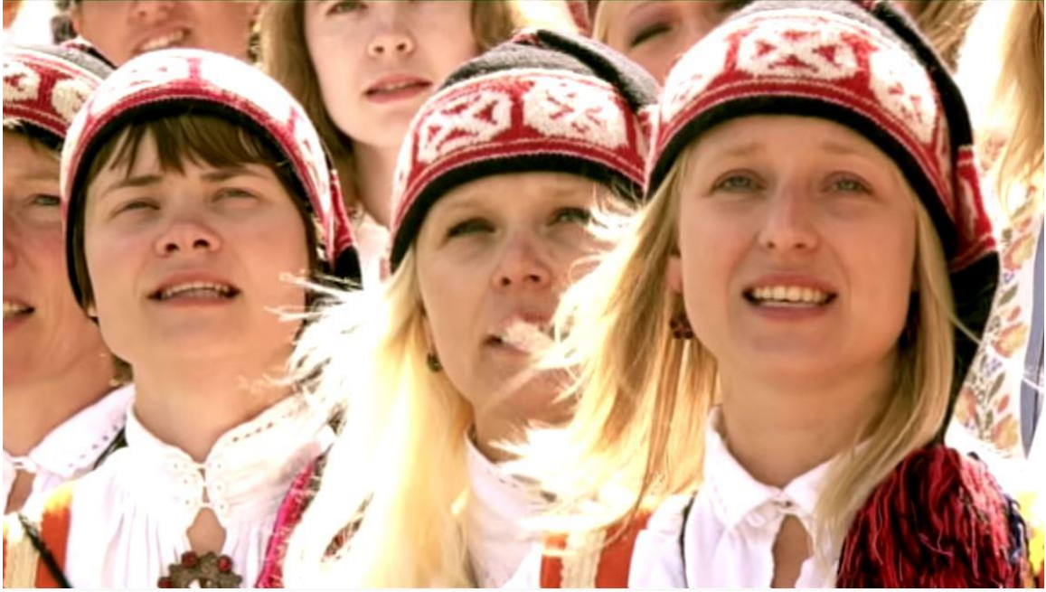
Estonian Festival Singers 2014